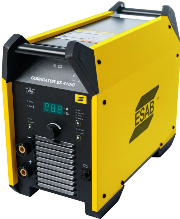
Fabricator ES 410iC

Fabricator ES 410iC is a heavy-duty inverter-controlled power source for MMA (Stick) welding, TIG (live-TIG) welding and CC Carbon-Air Arc Gouging.